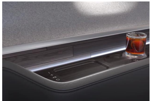
A deformable tray

F/LIST researches natural, high-quality and flexible materials to create shape-changing interiors that combine functional customer benefits with unsurpassed aesthetics to create more space in the cabin. One example is a flat real wood veneer tray that transforms into a tray for contactless charging of the phone when a mobile phone approaches. The fact that wood does not have to be a conservative material, but rather creates the transformation towards a highly functional and at the same time aesthetic material, was shown with this implementation. F/LIST can inspire customers with a repertoire of innovative materials and be a solution provider with high-quality products.