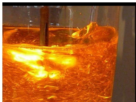
Phenolic resins as versatile binders

The project contributes to the economic and ecological provision of bio-based resins from the biorefinery products lignin and lignosulfonate. By linking lignin production and direct modification, a gap in the value chain of producing environmentally friendly binders is closed.