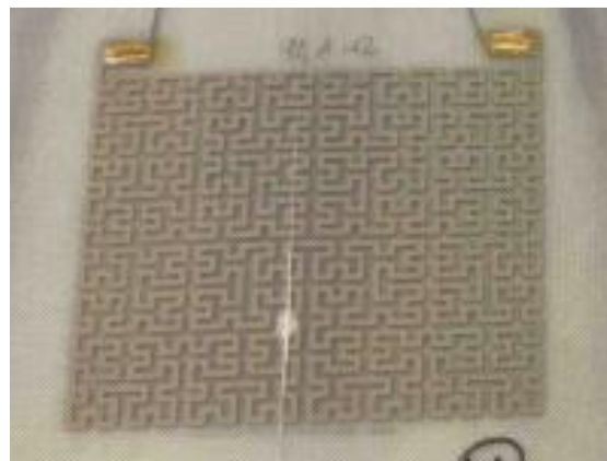
Figure 2: Simulated stone chip fracture sensor in fiber composite (©Wood K plus)