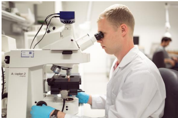
Fig. 1: Examining adhesive distribution by means of fluorescence microscopy (Wood K plus)

The methods to investigate resin distribution were already disclosed in 4 publications in scientific journals.